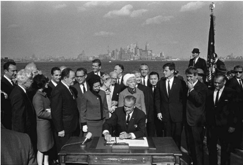
President Lyndon Johnson signing Hart-Celler Act, 1965.

The Hart-Celler Act of 1965 replaced the national origins system with a new quota system that gave preference to supporting family reunification and attracting skilled labor and professionals to the United States. It set the quota at an equal number for every country, regardless of that country's population or proximity to the United States. The act also expanded this quota system to countries in the Western Hemisphere, to which no limit had previously been applied. In this way, the Hart-Celler Act represented a radical break from previous immigration policy and has had a major impact on the nation since that time.